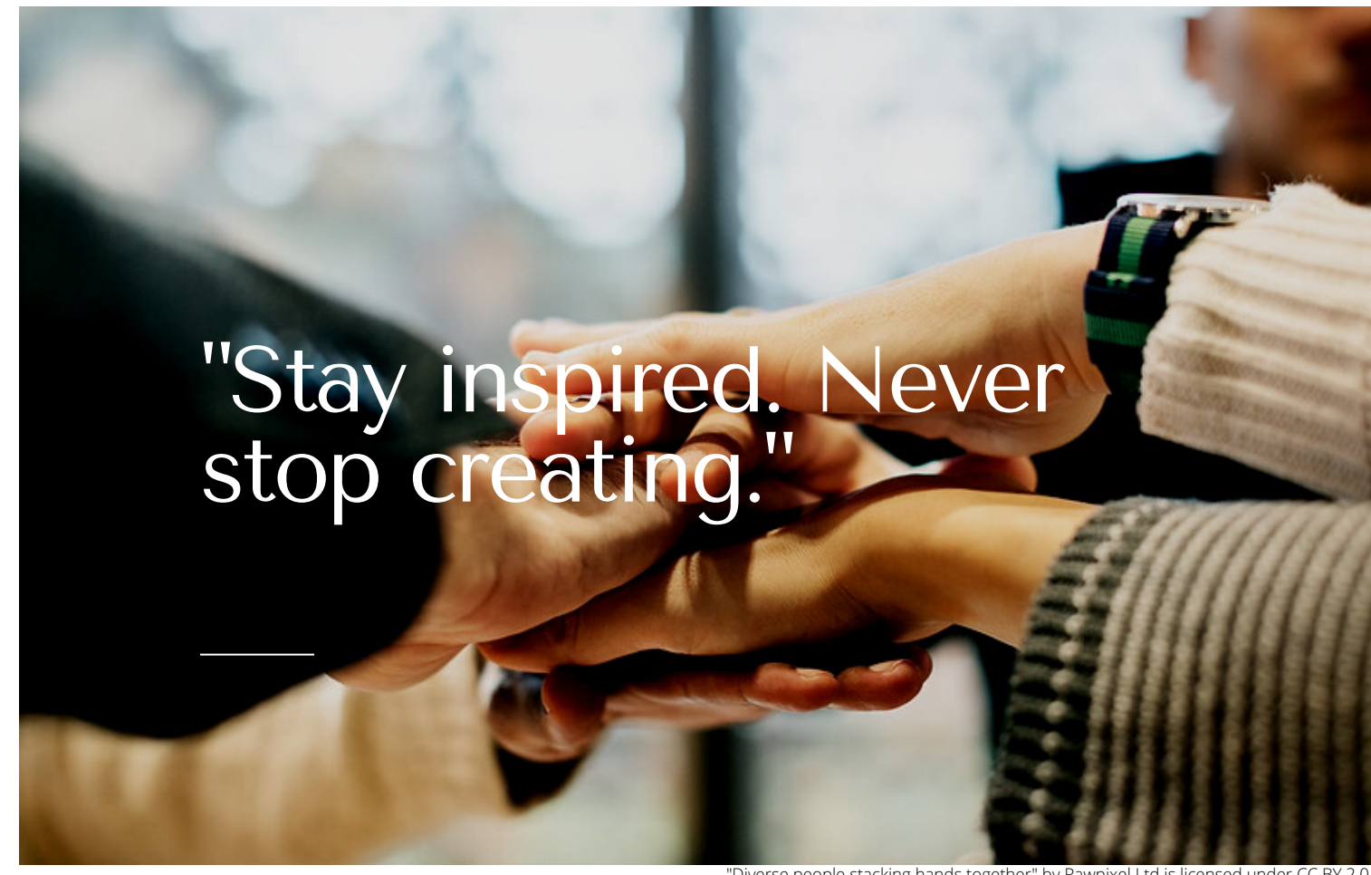
"Diverse people stacking hands together"