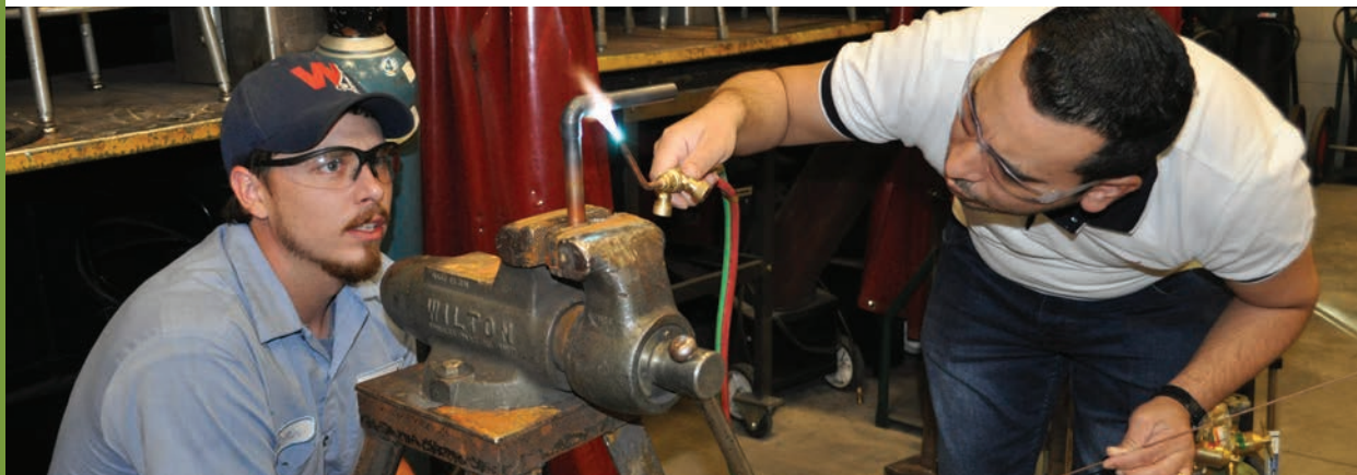
HVAC instruction at the Parham Road Campus. Many short-term workforce credential classes take between 6-12 weeks. Visit ccwatraining.org or call 804-523-CCWA for more information.

HVAC, CDL, MLT: These acronyms spell better money, especially for adult learners interested in boosting earning power, switching careers, and getting hired quickly. Through a new "Get a Job, Get Skilled, Give Back" (G3) grant, Reynolds is making it easier for job seekers and potential students to choose the trade or academic program that best suits their needs. This "one door" approach gets students advising and career services faster.